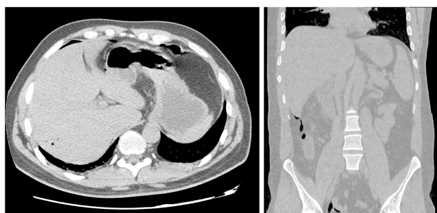
Figure 2. Disappearance of the subdiaphragmatic pneumoperitoneum between the 1st scan of the right vs left (D+2).